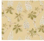
Chestnut Tree 225516