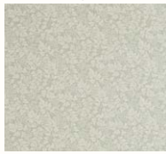
Spring Leaves 236461