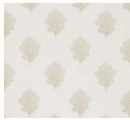
Oak Filigree 235603