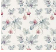
Fig Harvest 226330