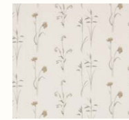
Meadow Grasses 235605