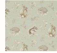
Squirrel & Hedgehog 225522