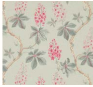
Chestnut Tree 225515