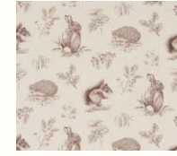
Squirrel & Hedgehog 225523