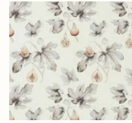
Fig Harvest 226326