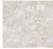
Chiswick Grove 226369