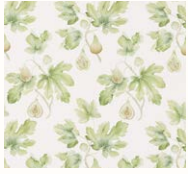
Fig Harvest 226329