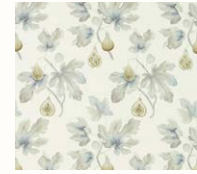
Fig Harvest 226328