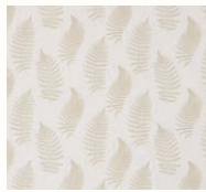
Fern Embroidery 235607