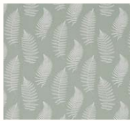
Fern Embroidery 235606