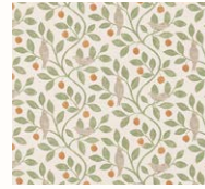
Damson Tree 226362