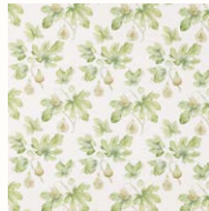
Fig Harvest 226329