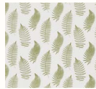
Fern Embroidery 235608