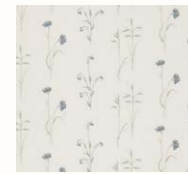
Meadow Grasses 235604