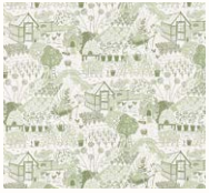
The Allotment 226360