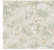
Chiswick Grove 226370