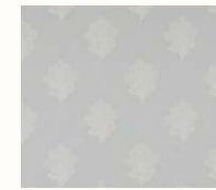
Oak Filigree 235602