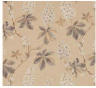
Chestnut Tree 225514