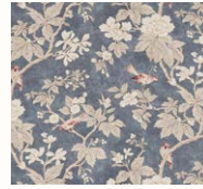
Chiswick Grove 226371