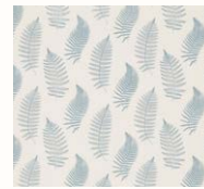
Fern Embroidery 235609